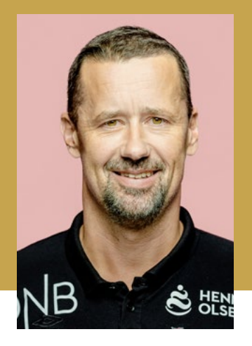
Arrivals during the season