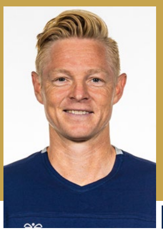
Arrivals during the season