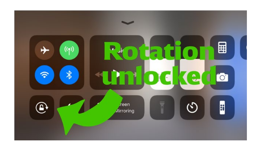
Examples of rotation lock on an iPhone

If you have any question regarding the guidelines or the live stream setup, please feel free to contact us: socialmedia@eurohandball.com.