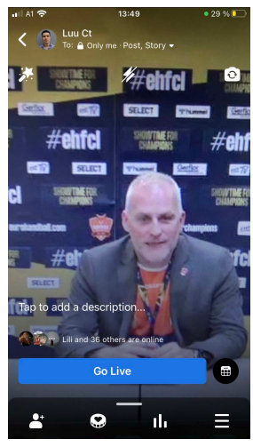
Bad phone orientation

The live stream will keep the same orientation until it ends. Before starting your live, you have to make sure that you are in the correct position. You have to position your phone in landscape mode before hitting the GO LIVE button.